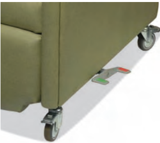
One touch speed lock