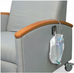
Drainage bag hook