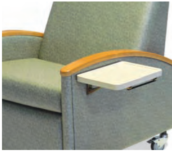
Folding side tablet