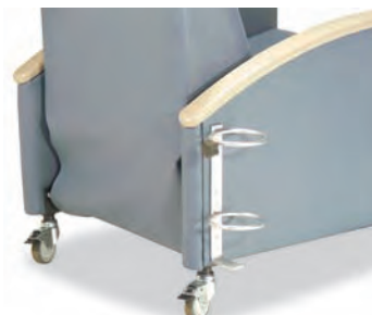
Oxygen tank holder