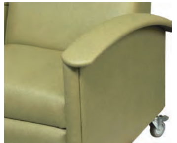
4" arm caps