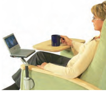
DVD and feeding tray