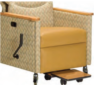
Rolling foot tray