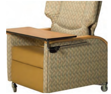
Removable feeding tray