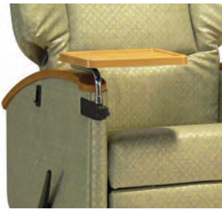
Swivel side tablet