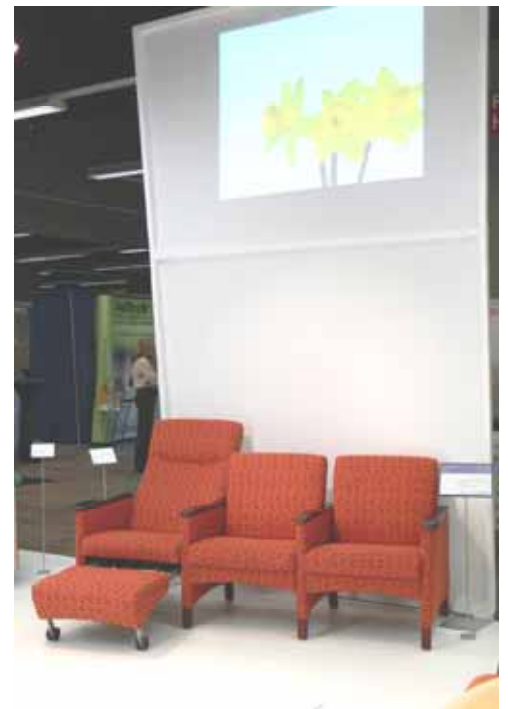
HEALTHCARE DESIGN CONFERENCE '06