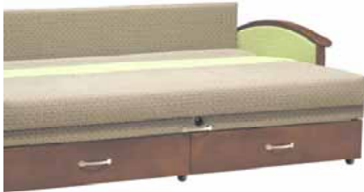
The Full House Sleeper Sofa, large enough for two overnight visitors

IoA offers the widest the collection of sleeper solutions in the industry. Eight sleeper sofas, each one with its own sleep surface dimension, foot print and method of conversion. Each sofa is available in 5 different arm styles or armless for built in applications. Drawers, casters and urethane arm caps are among the many options