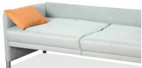
The 20-20 features a remarkably simple mechanism-less conversion

The IoA Overnight Collection brings families together in the patient room by providing sleeper sofas that are comfortable, intuitive and durable, in a wide variety of sizes and foot prints to fit even in the most challenging of lay outs.